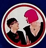
TOASTMASTERS ANNALEE NEWITZ AND CHARLIE JANE ANDERS