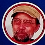
AUTHOR GUEST OF HONOR CHARLES DE LINT